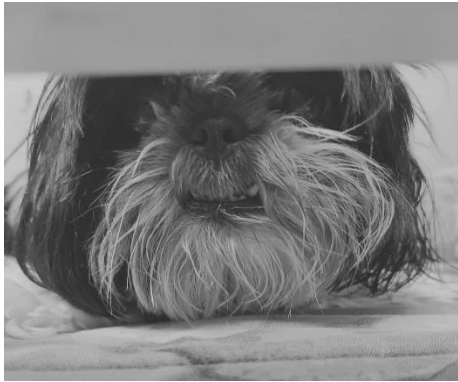
Prince Clover tries to hide from the camera!

Care for creatures! Our school community loves animals. God created different types of animals, and we love them all. Because we love them, we need to show affection too!