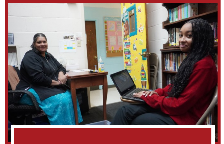
A journalism student holds an interview for the "Eaglets' View."

Besides our core classes, middle school students expand their horizons through electives. Some legacy electives like ASL, chorus and film have been offered for years. Others like blogging, financial literacy, and liturgical dance are relatively new. Each option gives our students a more comprehensive educational experience.