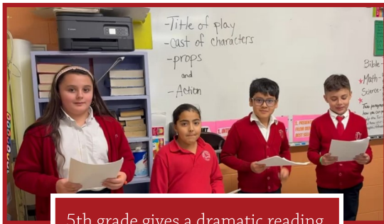
5th grade gives a dramatic reading.

After Christmas break, students work to regain positive momentum in their different studies. While elementary students focus on reading and writing, middle school students give attention to midterms. This process is challenging but rewarding for each.